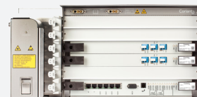
hiT 7300 Flatpack Shelf with 5 traffic slots